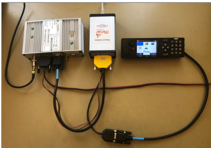
Sepura SRG with Network Interface and cable kit

Connect the interface to both the standard control head and to the radio unit.